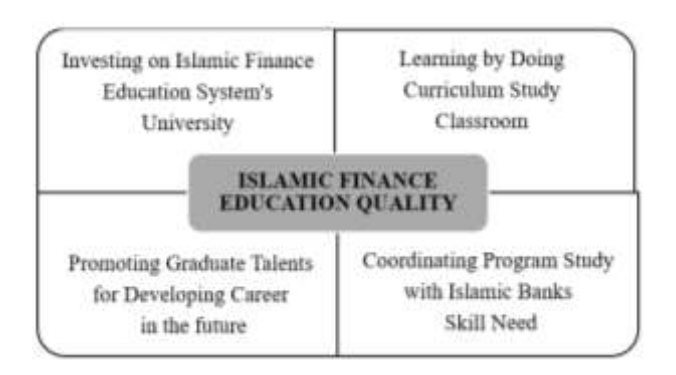
Figure 3. Improving Quality Education of Islamic Finance Study

In fact, a critical study found that 73 % of graduate talents from the Shariah Economy Educational Program in Indonesia need practical training to work on Islamic banks skilfully (Yusuf, 2015). For example, a claim by the Financial Service Authority (FSA/OJK) which is a governmental agency that regulates the Indonesian banking sector predicted that to strengthen Indonesia's Islamic banking system - the total financial asset must be increased from 6% to 15% in 2023, and to achieve this strategic goal - Islamic banks in Indonesia need 11,000 high-skilled professional Shariah banking experts to meet their demand workforce in the future. As well, FSA also stated that currently, Indonesian public and private educational institutions prepare and produce only 3,750 graduate talents annually in the field of Islamic economy program study which is really inadequate to support the strategy FSA foresight for Islamic banking stability growth in Indonesia. For this reason, while interviewing one of the participants stated that: