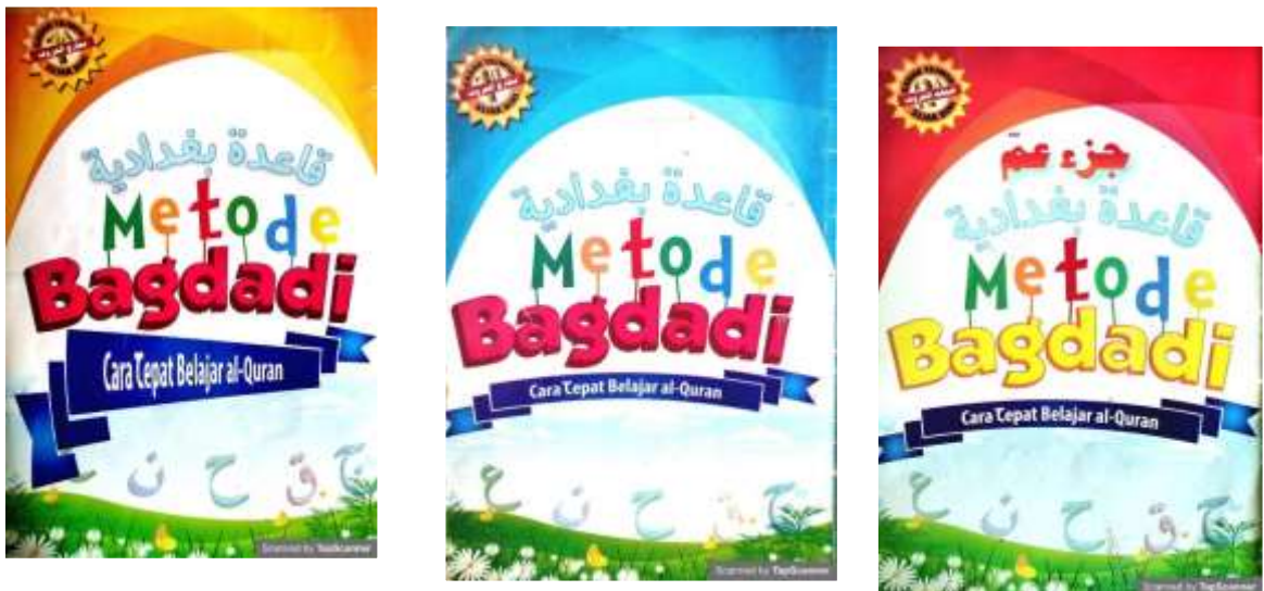
Figure 1: Method Learning Guide Panduan Baghdadi