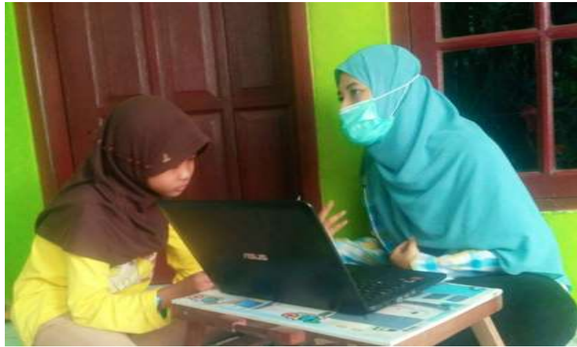
Figure 1. Photo of the Implementation of the Interview