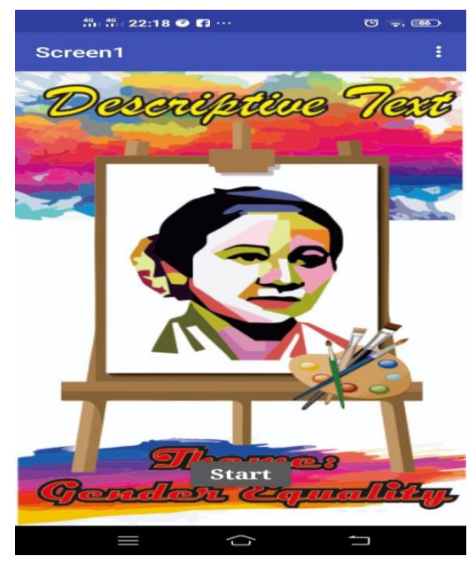
Figure 1. The layout of mobile app

The product initial development could be seen below.