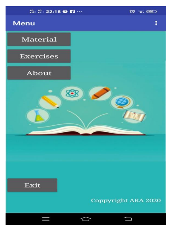
Figure 2. The layout of the mobile app