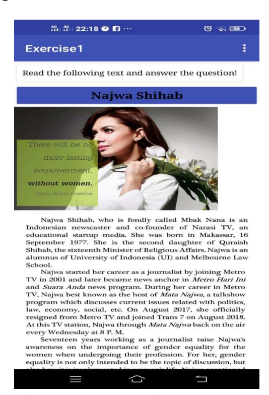
Figure 3. The layout of the mobile app

All of the contents in this mobile app are created through a mobile app marker in the website kodular.id. There were some steps in creating this mobile app: