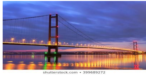
Picture 3. not – related images of Indonesian context.

Then, there are some foreign cultures also found in the textbook portrayed, such as the Humber bridge in England and San Juan Island in Washington. Although some foreign cultures are not related to Indonesian cultures, the images can expand the students understanding and tolerance about the culture. Foreign and native culture should be put as one (Byram, 1989; Kramsch, 1993; Hinkel, 1999; Cortazzi & Jin, 1999) as cited in (Faris, 2016). By knowing the pictures in the textbook, the students will increase their understanding the Indonesian and foreign culture as well.