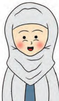
Picture 2. Related images of Indonesian context