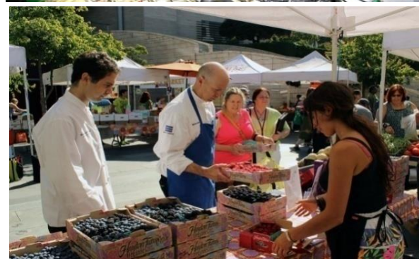
Picture 1. Images representing equal occupation between females and males.