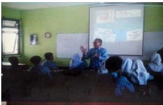
Figure 4 Energizing students by singing and various clapping hands

There were 9 activities done by the observed teacher during the third lesson. In the pre-activity, the teacher stood in front of the students and greeted the students by saying “ Assalamu’alaikum ”, “Are you fine today?” at the beginning of the lesson. It was very clear that this practice was not a creative one. On the next action, the teacher motivated the students by singing the song “If you are happy and you know it” together. This implementation belonged to the creative one as it functioned to prepare the students’ psychological condition before going to the main material. This action was suitable for the second indicator of creative teaching, creating new and meaningful ideas. The teacher continued energizing the students by saying “Clap your hands”, “Stop”, “Single clap”, “Double claps”, “Triple claps.” The students directly follow the teacher’s command. Since the teacher linked new ideas to others effectively, the teacher has done the fourth aspect of creative teaching. In addition, clapping hands in various ways meant that the teacher showed originality in work and it belonged to indicator 6. The situation of the teaching implementation was shown in the following figure.