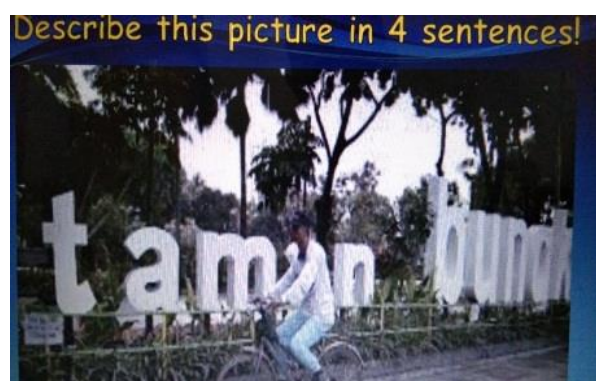
Figure 6 Describing public place in 4 sentences

Further activity was in a collaborative discussion, teacher gave the students piece of paper and wrote the characteristics of places from the pictures taken from https://www.englishexercises.org/makeagame/vi/ewgame.asp?id=7711 and https://www.englishexercises.org/makeagame/vi/ewgame.asp?id=8334 . From both links, the students could see some public places and some adjectives relating to the condition of the places. The teacher wanted to enrich the students' vocabulary in a collaborative discussion. That activity referred to indicator 2 (creating new and meaningful ideas) and indicator 3 (elaborating own ideas to develop creative efforts). The last action in the main activity was the teacher showed some pictures of public places. Then, the students described the pictures in 4 sentences. While the teacher was showing the picture of Bungkul park, the students tried to describe the place even with imperfect description. However, the teacher's effort in this activity has reflected indicator 5 and 7, being responsive to different views and viewing mistakes as a chance to learn. The teaching material of describing places in 4 sentences could be observed in the following figure.