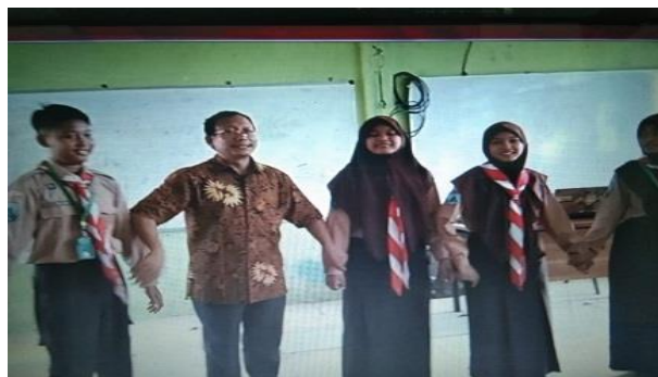
Figure 7 Warming up activity in a standing circle

The last observed lesson was the fifth one. During this session, the teacher conducted 8 activities. In the first pre-activity, the teacher and the students started the lesson by standing in the middle of the class. The chairs were arranged on the side of the class. Since that was unusual, the teacher has used extensive range of idea construction technique (indicator 1). From the video recording, the teacher seemed to be ready with the special learning activity without having seats. That was also suitable with the indicator of creating new and meaningful ideas (indicator 2) and elaborating own ideas to develop creative efforts (indicator 3). The next action conducted by the teacher is greeting the students by saying "Good morning class", "How are you today?" That was a non-creative activity as conducted by common teachers. Further activity was students were hand in hand doing warming up activity in a circle. The teacher asked the students to follow his instruction: "Jump in", "Jump out", "Jump left", "Jump right." This teaching activity reflected using extensive range of idea construction technique as stated in the first indicator. Moreover, it also created new and meaningful ideas as the teacher's intention was to prepare students for the main activity. It was suitable for the second indicator of creative teaching. The activity in the pre-activity could be seen in the following figure.