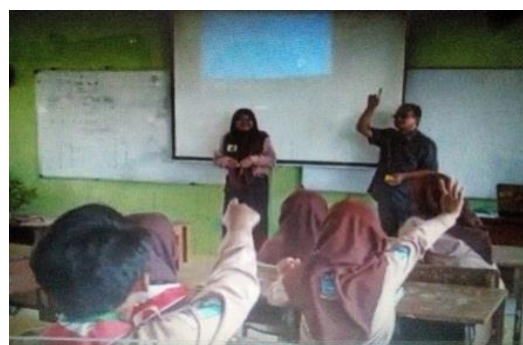
Figure 3 Guessing things from body movements

movements. This activity seemed to be the activity of Total Physical Response (TPR) since the activity dug up meaning in the form of body movements (Freeman, 2000). This implementation belonged to creative action since it created new and meaningful ideas (indicator 2). The use of music before guessing the body movements indicated that the teacher used extensive range of idea construction technique (indicator 1). Receiving the students' answers showed that the teacher was responsive to different views (indicator 5) as well as viewed mistakes as an opportunity to learn (indicator 7). The last main activity was similar to the previous one. However, in this activity the teacher conducted a group work in guessing the students' body movements. This practice specified the fourth creative teaching indicator, connecting new ideas to others effectively. The situation of teaching implementation in the main activity could be seen in the following picture.