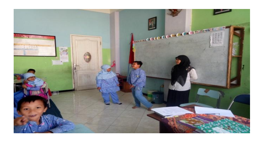
Figure 6. Implementation of Evaluation Process

Through figure 5 and 6, the assessment process for the cognitive aspects of students is in the form of song creation; while the psychomotor assessment of how students express words, sentences that are arranged properly and correctly. Students can change the structure of Arabic sentences using the situations and conditions they have. Each theme that is studied has a different song instrument. This avoids student boredom so that later they can increase their creativity in composing the song.