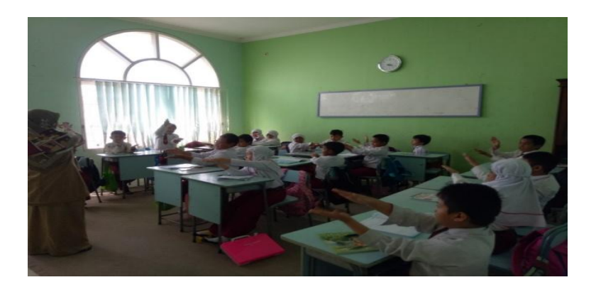
Figure 5. Implementation of Evaluation