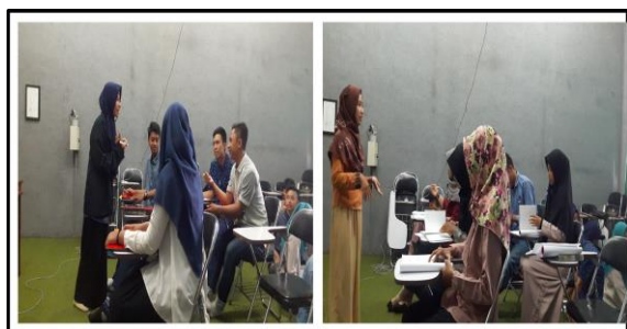
Figure 1. The Students' Speaking Performance

During teaching activities in Practical Classroom English course, students should do simulation. Doing simulation was required to demonstrate some teaching instructions and expressions as English teacher in classroom. Furthermore, doing simulation in speaking English performance involves various personality aspects, such as attitude, anxiety, personality, emotion, motivation, and self-confidence. Since self-confidence is one of the most influential variables that affects the students' oral skill in their speaking English performance. The following figure showed the students' activities doing simulation.